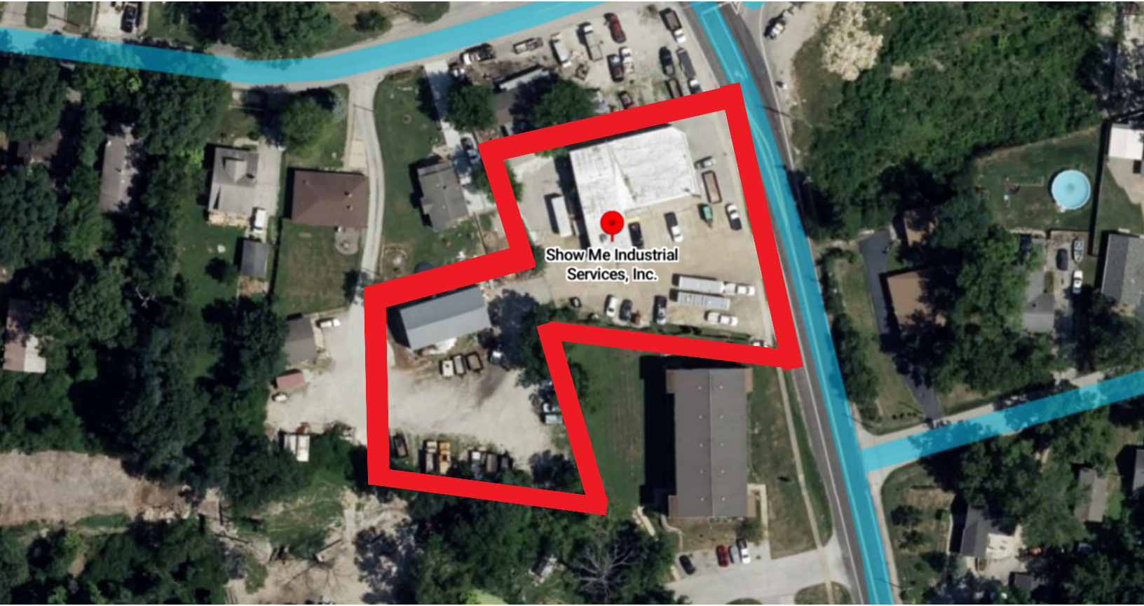
Show Me Industrial Services, Inc.